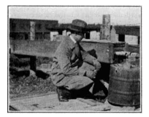
Fig. 3.-Discharge end of condenser.

The retort used is shown in Fig. 1. It was surrounded by a wooden box, packed with straw, to prevent condensation of the steam. This was thought necessary on account of the small size of the retort and the cold weather. The retort is of 3 cu. ft. capacity and holds 35 to 45 pounds of plants. In our experi-